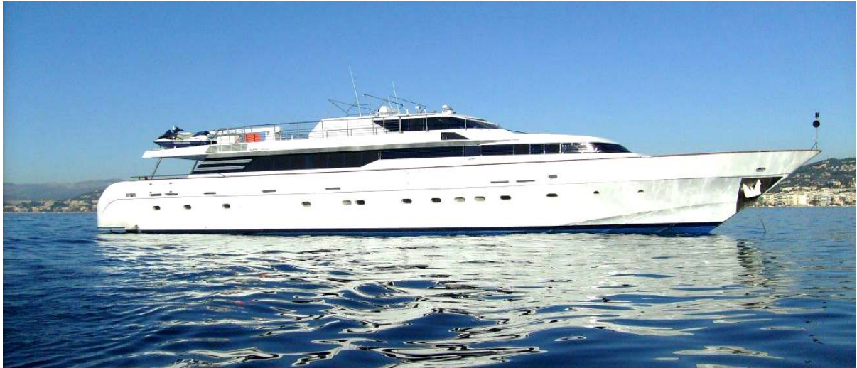
SIAR MOSCHINI - BENETTI 105' - powered by MTU – Kamewa Rolls–Royce jets

A superb 32m SIAR-MOSCHINI BENETTI , powered by double MTU's on Rolls Royce water jet propulsions, Perseus Star cruises in excess of 28+ knots.